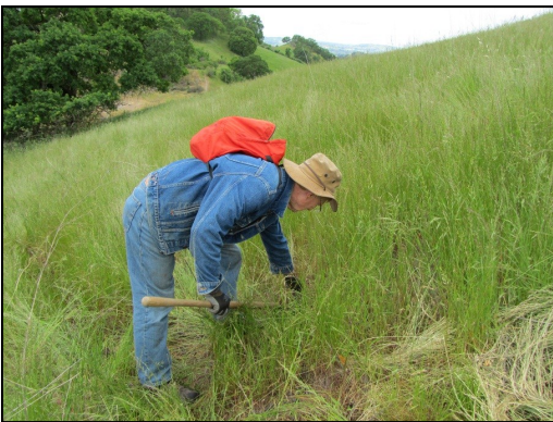
Bill Barnard searches and destroys single mustard plants at Sutherland--outliers that migrate from the pack and extend the reach of the invading army.

The group decided to focus on Shell Ridge Open Space because its mustard infestations were the broadest, covering scores of acres, mainly on west-facing slopes and hillsides. We'd initially thought we could, with the help of City staff and equipment, do some industrial-strength mowing and hold back further enemy advances. But the rainy weather stymied our efforts—and gave the mustard a big head start.