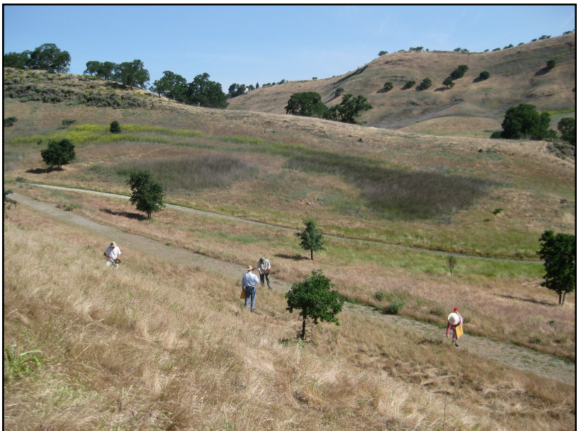
Restored oaks near the Sutherland entrance to Shell Ridge