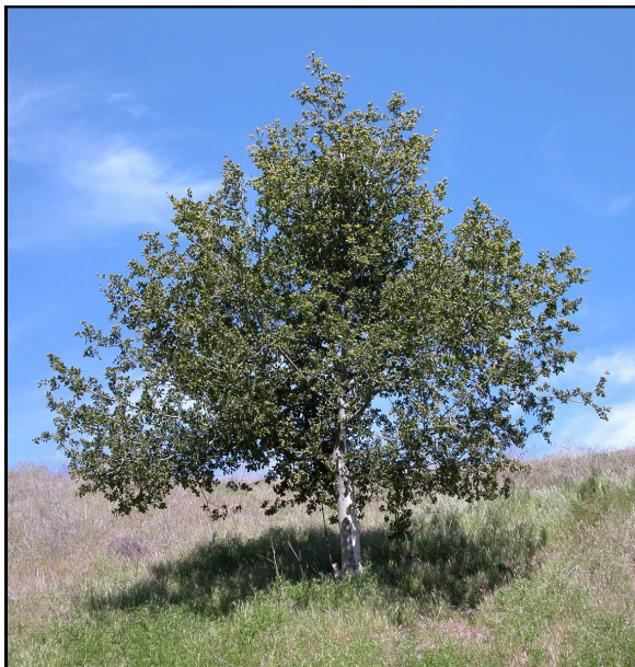
Coast Live Oak just above Willow Spring Pond