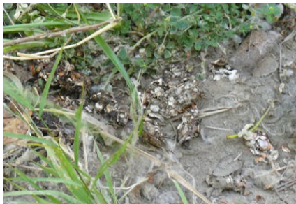
Scat full of crayfish shells