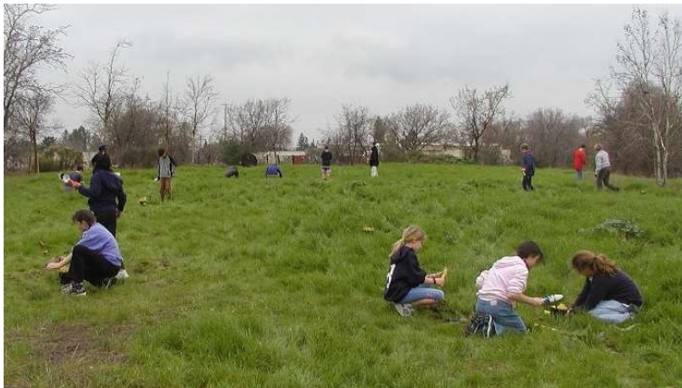
Planting native grass at Heather Farm, 2004