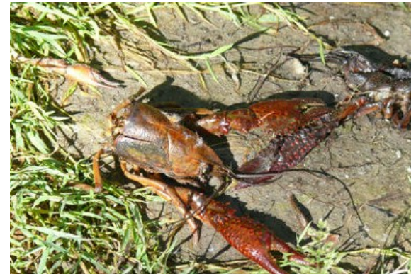
Partially eaten crayfish - a sign that otters have been to dine

Otters are everywhere this summer, it seems. In addition to their usual haunts, one has been spotted in Alamo on San Ramon Creek. At least two otters spent a month living – and fishing – in Civic Park. A pair has had young at Heather Farm's natural pond. There was another den at Heather Farm about three years ago, so perhaps this will become a regular event. Certainly Heather Farm is a major stop on the crosstown wildlife corridor. Otters can be hard to see, but they leave signs like slides, partially-eaten fish, and scat.