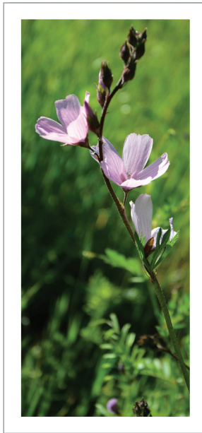
Sidalcea malviflora , (CHECKER MALLOW), Acalanes Ridge.