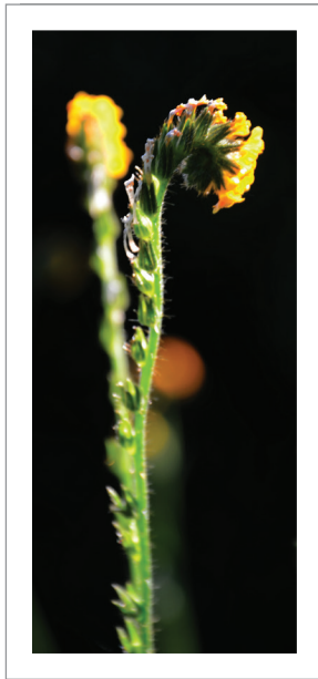
Amsinckia (FIDDLENECK), Sugarloaf.