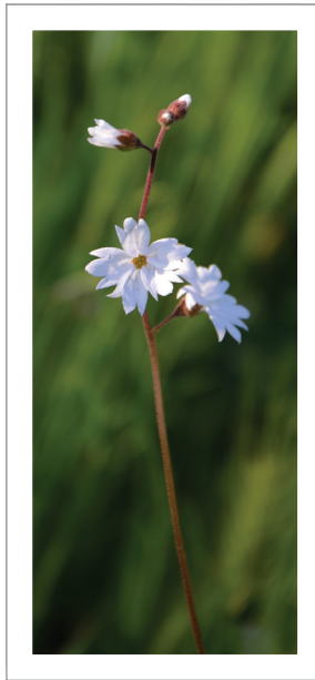
Lithophragma (WOODLAND STAR), Shell Ridge.