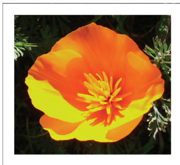
CALIFORNIA POPPY ( Eschscholzia californica )