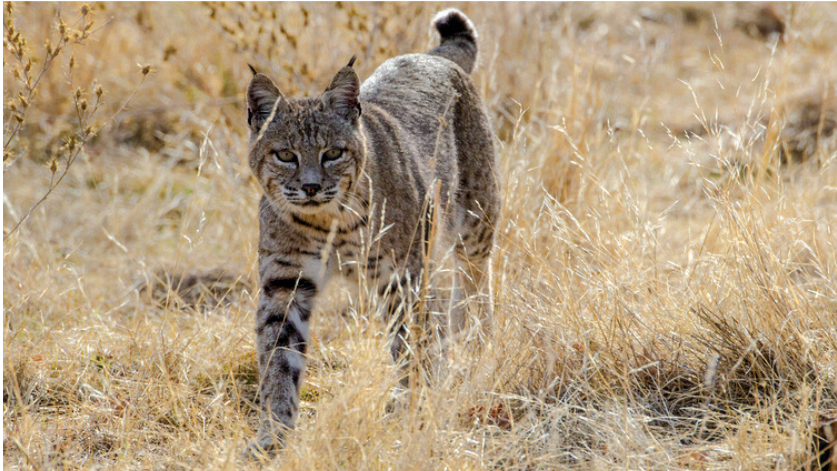
Bobcat at Round Valley Regional Preserve, Brentwood.