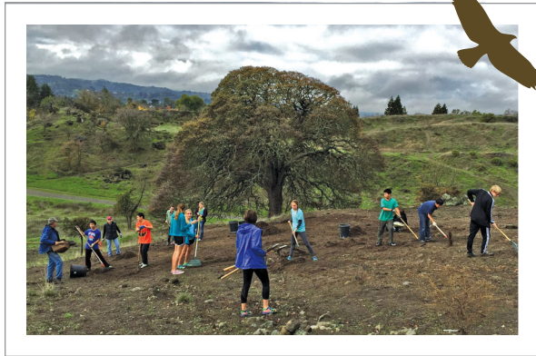
Partying at Fossil Hill— Students from Las Lomas Eco-Action Club and Fremont’s Irvington High help prepare the soil for planting 10,000 natives.