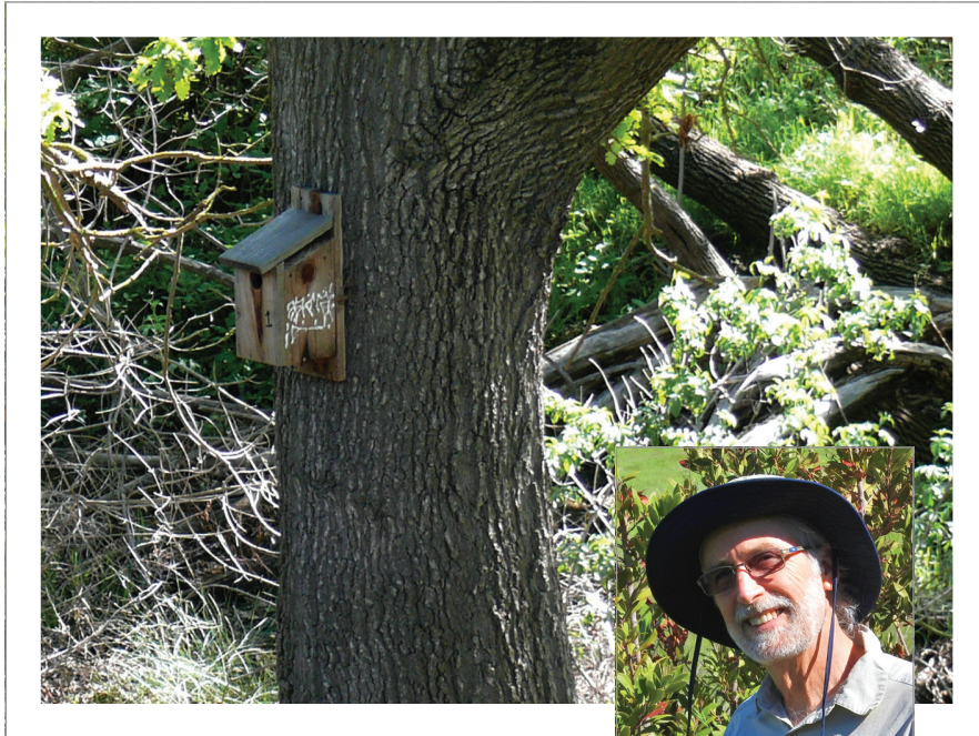
Bluebird box