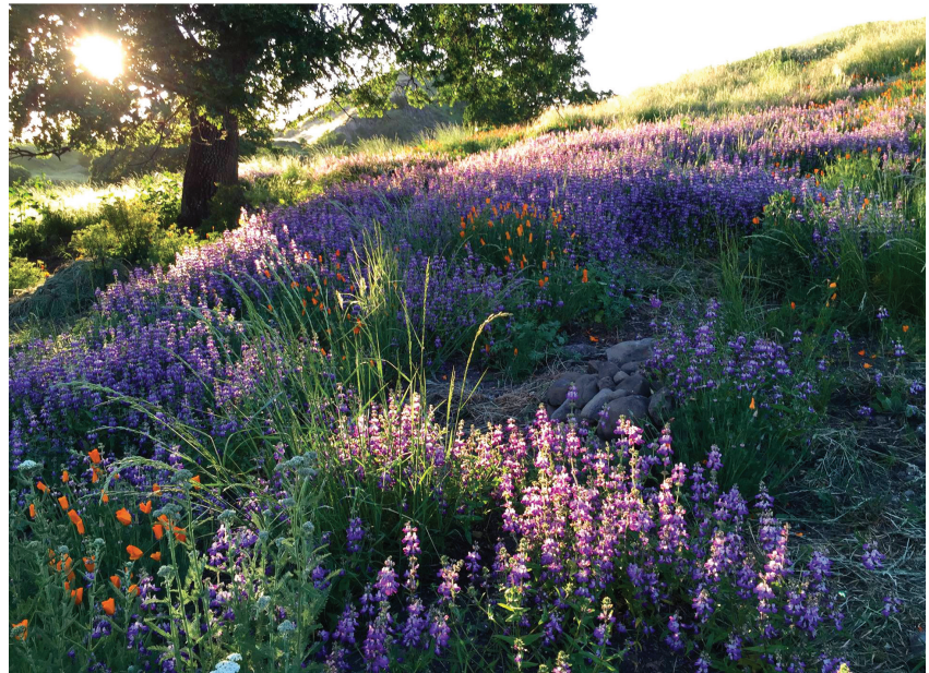
If John Muir had walked past Shell Ridge on one of his sojourns, he might have seen wildflowers like this on Fossil Hill, near the Sutherland Gate at Shell Ridge Open Space. Volunteers, working every other Saturday, have planted 12,072 native plants in the 2015-16 season.